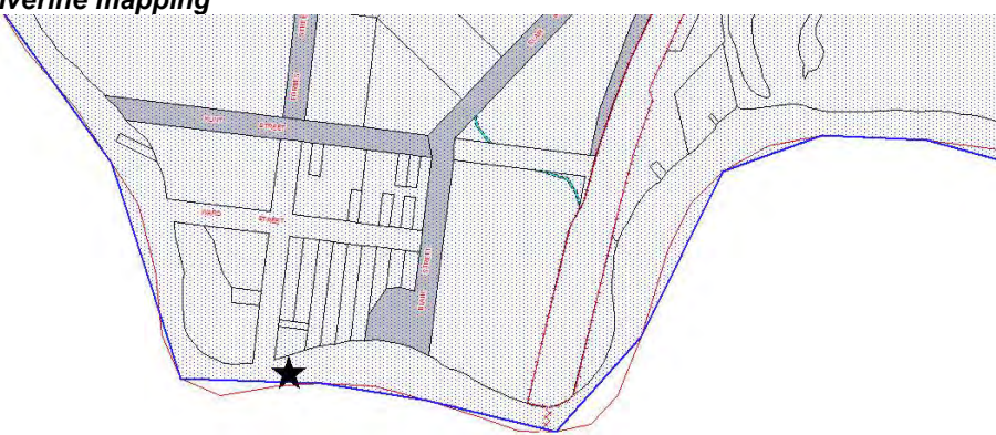
Figure 5 – Flood prone land mapping