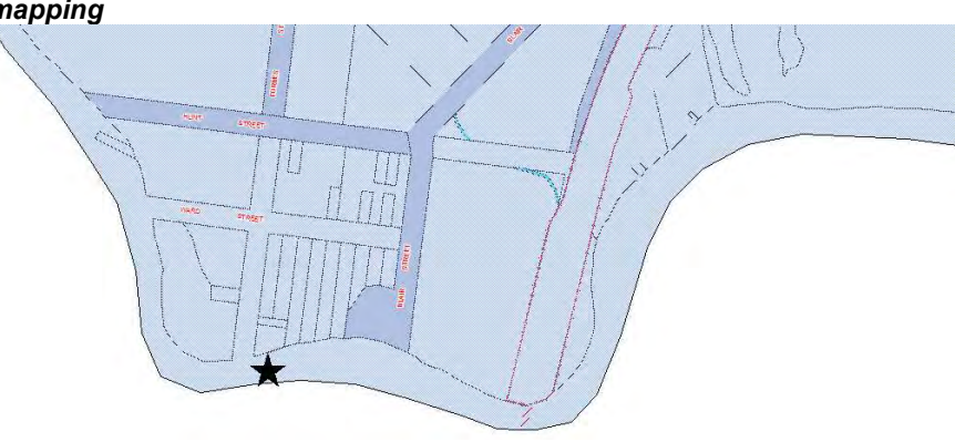
Figure 6 - Bush fire prone land mapping